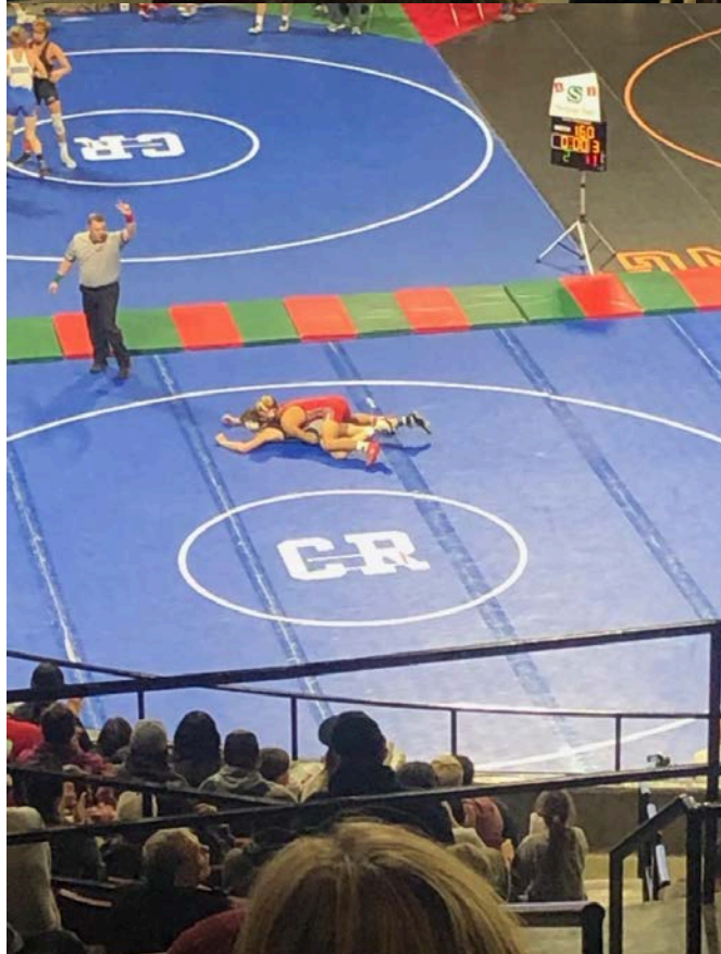
Tahj Wells ended up winning by a pin.