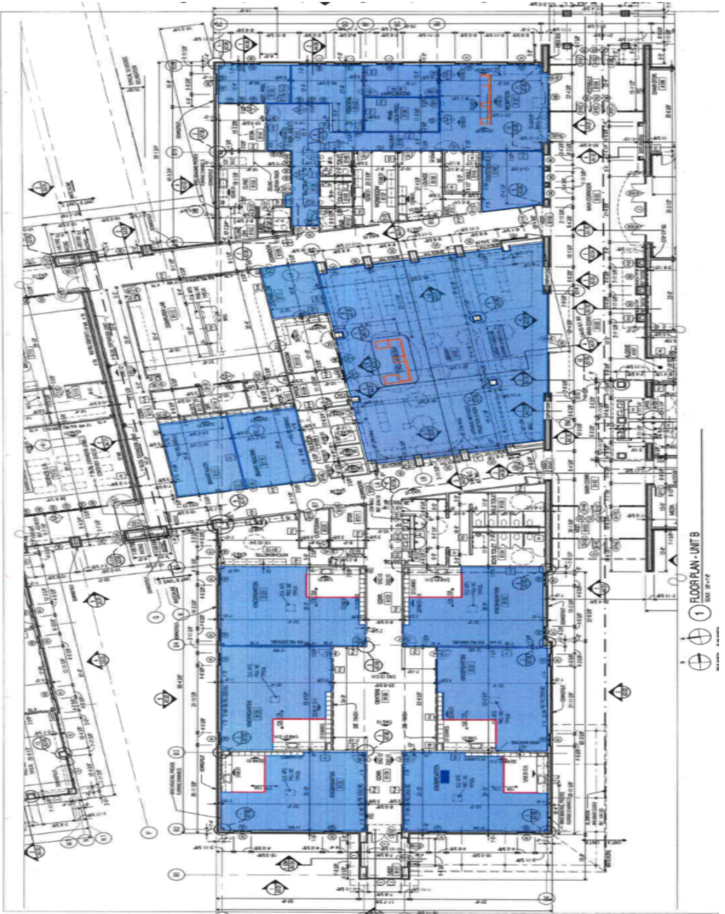
1 FLOOR PLAN - UNIT B 1/8" = 1'-0"