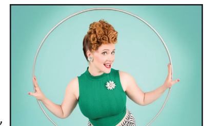
Hooperina, July 19

Hooperina will entertain and engage audiences of all ages with one of our favorite toys- the hula hoop! You are invited to bring along your own hula hoop to join in the fun! ECFE will give away a free hula hoop to the first 150 children in attendance.