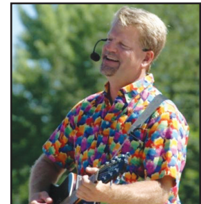
World of Woody, June 28

Every show features Woody's many talents highlighted by music and sing-alongs, juggling, some rock & roll, a little magic, dancing and plenty of audience participation all rolled into one nonstop interactive entertainment experience, sure to please kids of all ages!