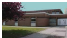
Pinecrest Elementary Grades K -4

1601 West 12th Street Hastings, MN 55033 (651) 480-7390