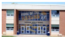
Hastings Middle School Grades 5 - 8

200 General Sieben Drive, Hastings, MN 55033 (651) 480-7470 (651) 480-7690