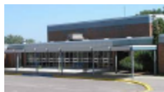
Kennedy Elementary Grades K - 4

1000 West 11th Street, Hastings, MN 55033 (651) 480-7060