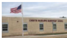
McAuliffe Elementary Grades K - 4

1175 Tyler Street, Hastings, MN 55033 (651) 480-7220