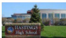
Hastings High School Grades 9 -12 and Area Learning Program

1000 West 11th Street, Hastings, MN 55033 (651) 480-7000