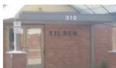
Tilden Community Center Early Learning Programming, Adult Education, Family Education, Community Education

975 West 12th Street Hastings, MN 55033 (651) 457-9426