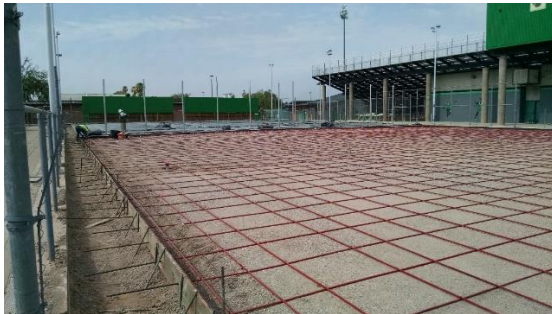
Tennis Court Post-tension Work