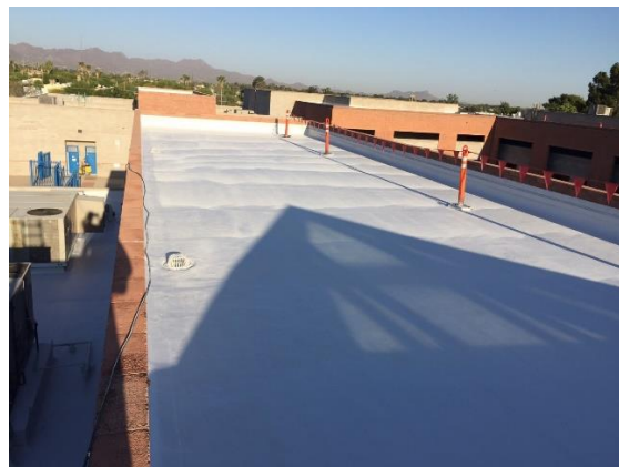
Keeling Administration Roof