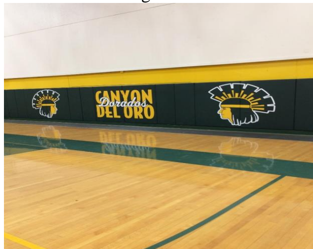
South Gym Padding and Painting