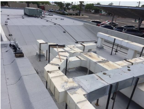
Roof at Keeling Annex