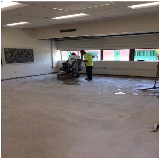
Grinding Classroom Concrete Floor