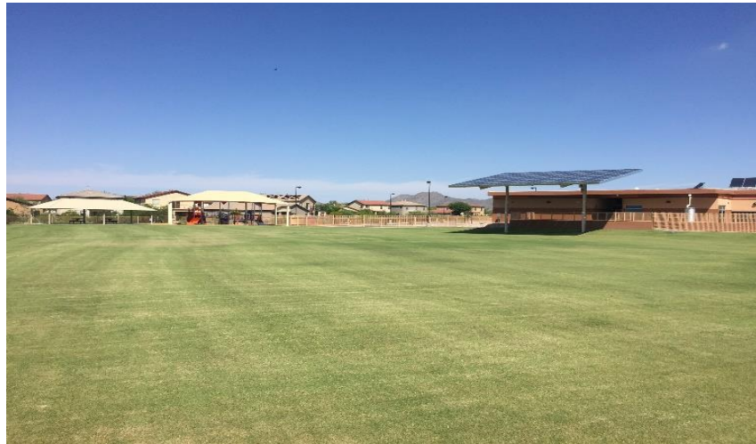
Solar Array and Canopy's

Innovation Academy Is Complete On Time and On Budget