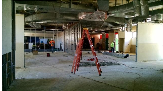
Building 700 Renovation