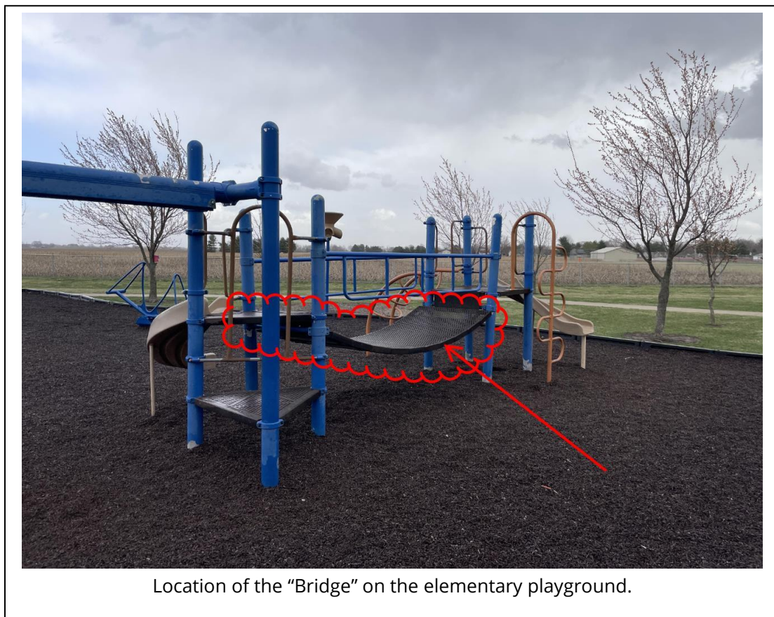
Location of the "Bridge" on the elementary playground.