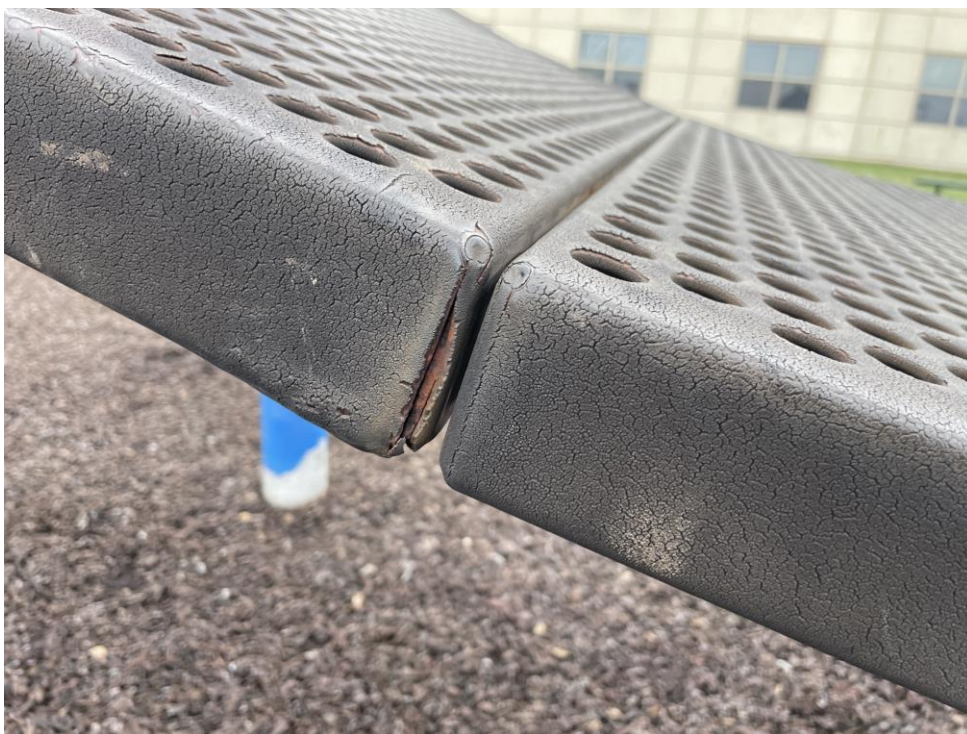
Close-up image of deterioration and sharp rusty edges.