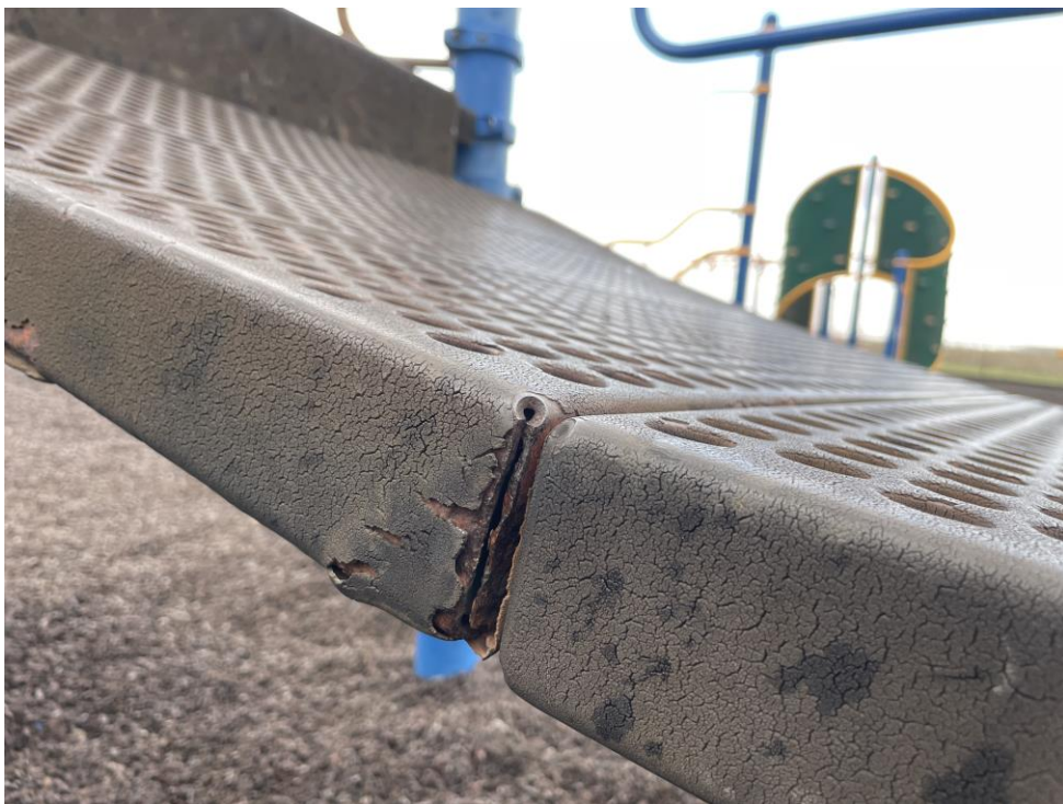
Close-up image of deterioration and sharp rusty edges.