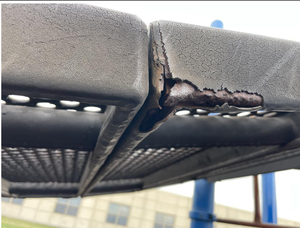
Close-up image of deterioration and sharp rusty edges.