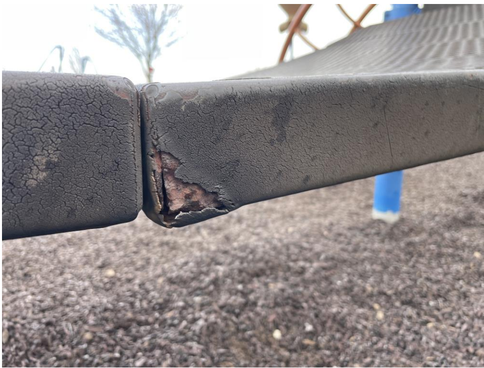
Close-up image of deterioration and sharp rusty edges.