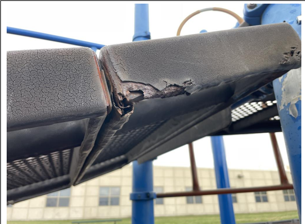
Close-up image of deterioration and sharp rusty edges.