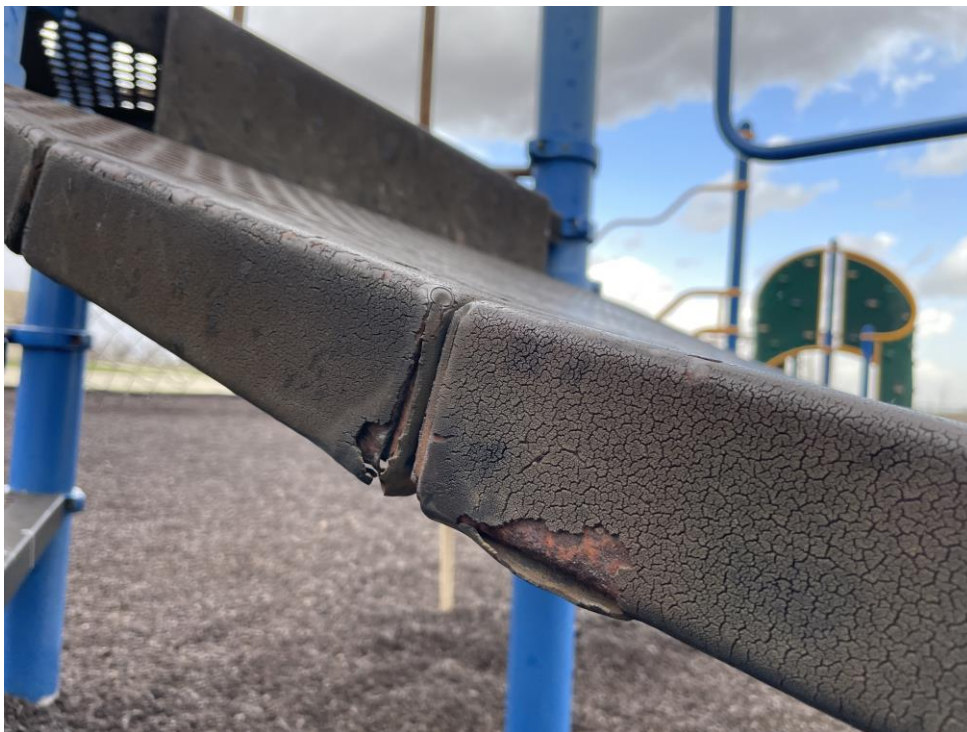
Close-up image of deterioration and sharp rusty edges.