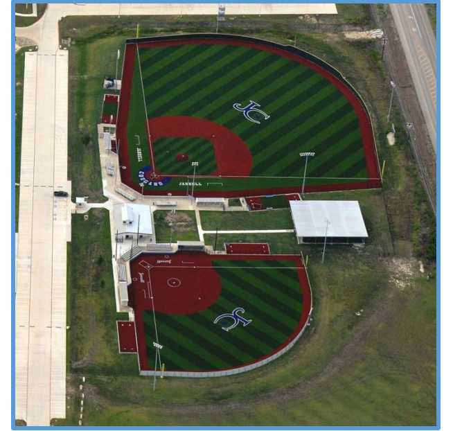
Baseball / Softball Complex