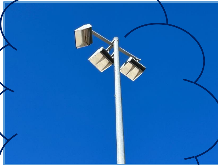
Tennis Courts LED Lights (2022 Install)