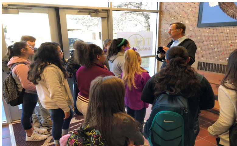
Picture from previous Paw Pals speaker