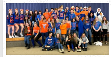
BLUE AND ORANGE SPIRIT DAY!