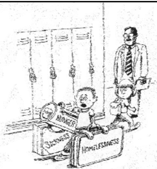
"Could someone help me with these? I'm late for math class."