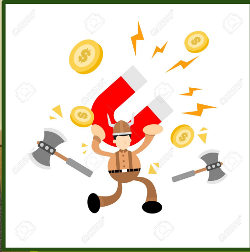
Jace Searle, First Place at the TRSD Science Fair, Physics-Electromagnetic category