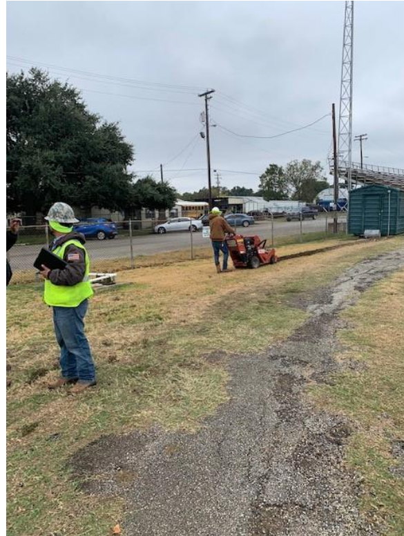
Staging & Mobilization of Earth Moving Equipment