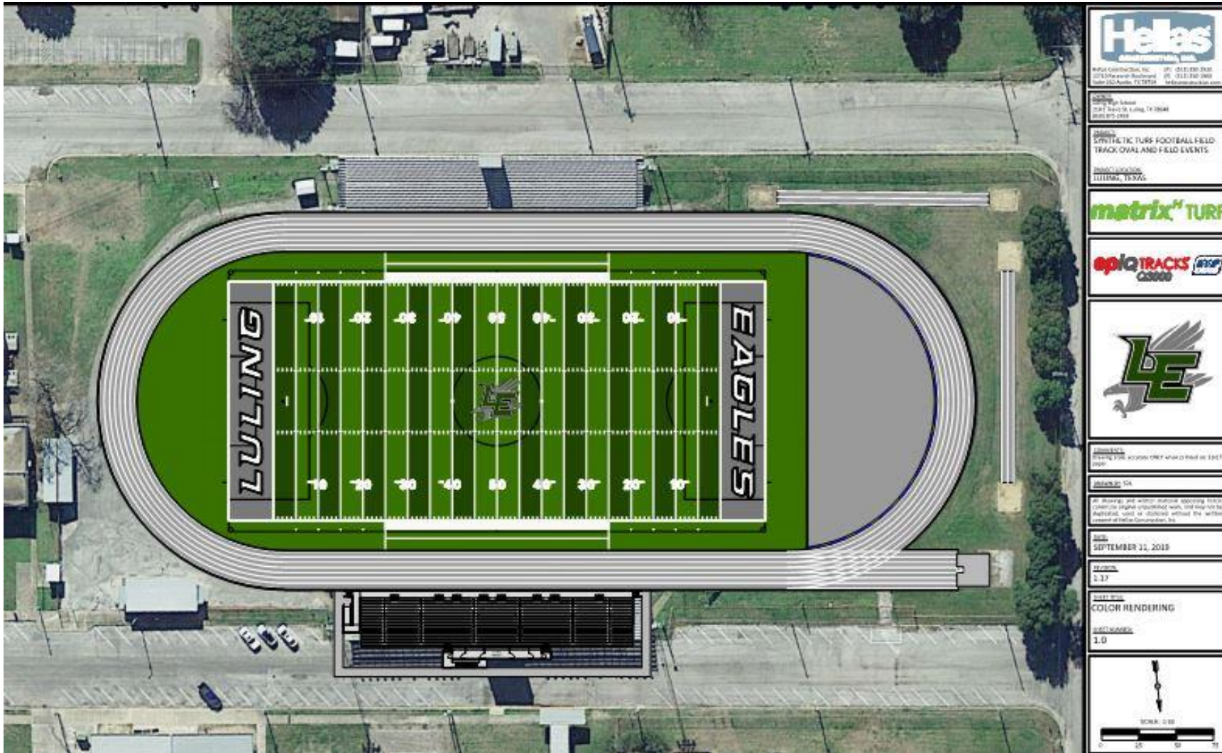
Proposed Stadium & Track Improvements