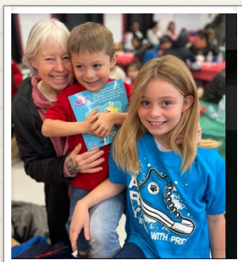
TIME WITH FAMILY