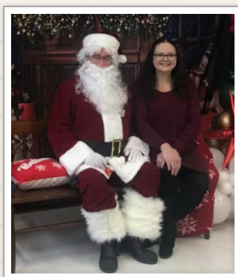
PHOTO WITH SANTA