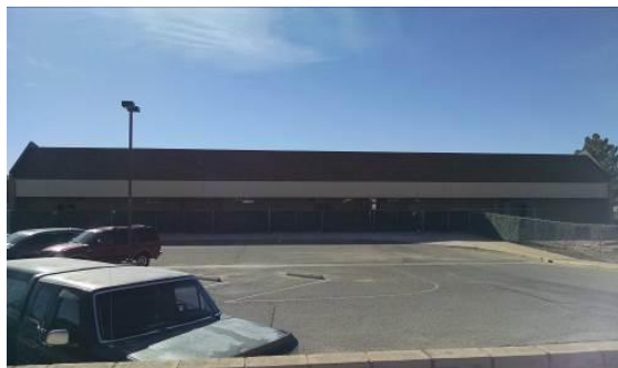
North Face of New Building

The Mesa Verde project is on schedule and on budget