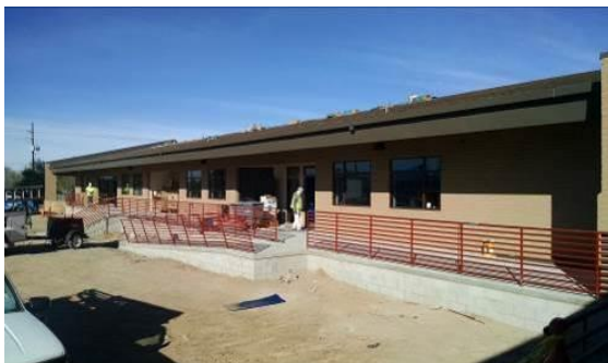
South Face of New Building

W-2 classrooms moved into portables to make way for renovation