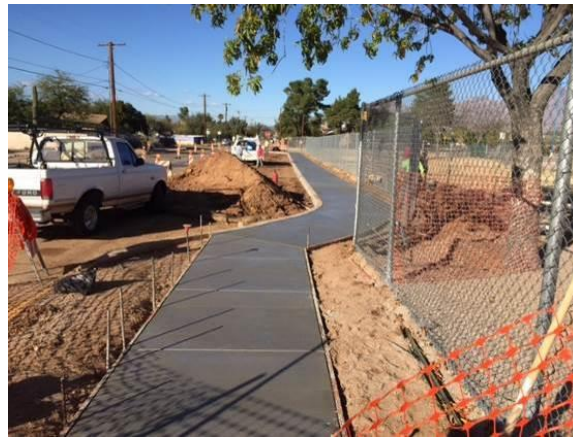
Curbing and sidewalk

The project was 6 weeks behind schedule and $2,962 over budget (City of Tucson water line issue being corrected)