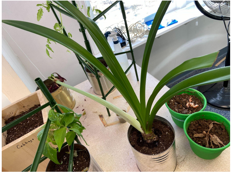
Fertilized Amaryllis plant with fallen stem