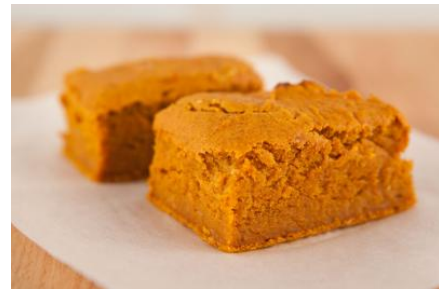
Homemade Pumpkin Bar