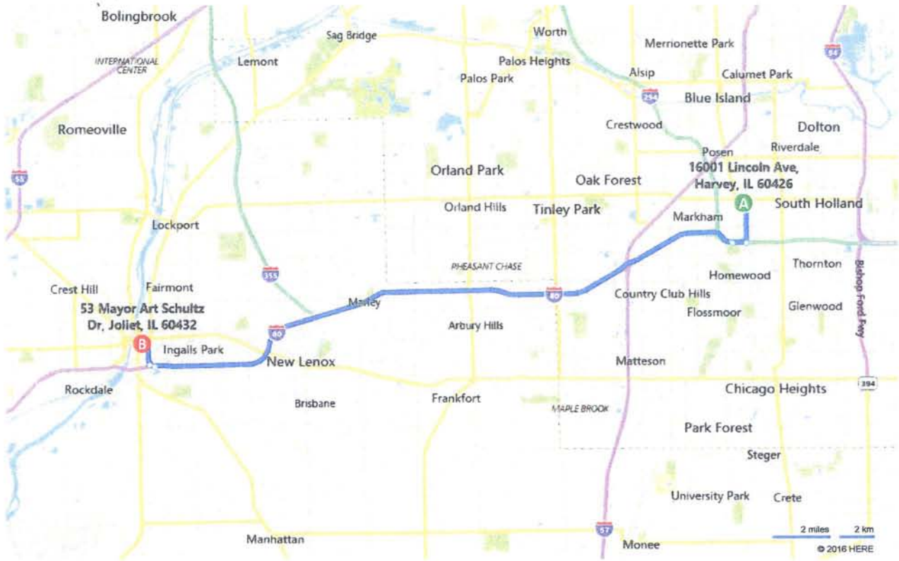
A 16001 Lincoln Ave, Harvey, IL 60426