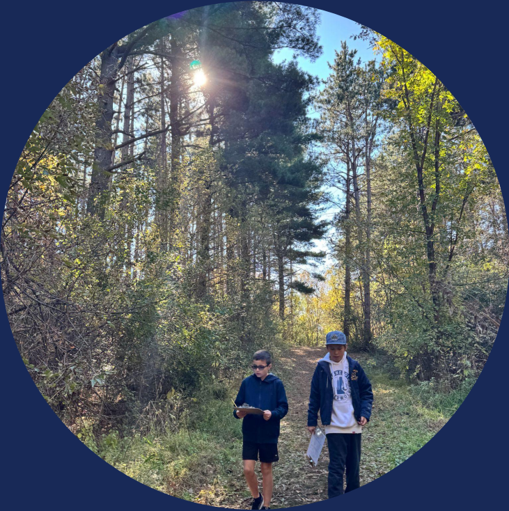
OHA Nature Day