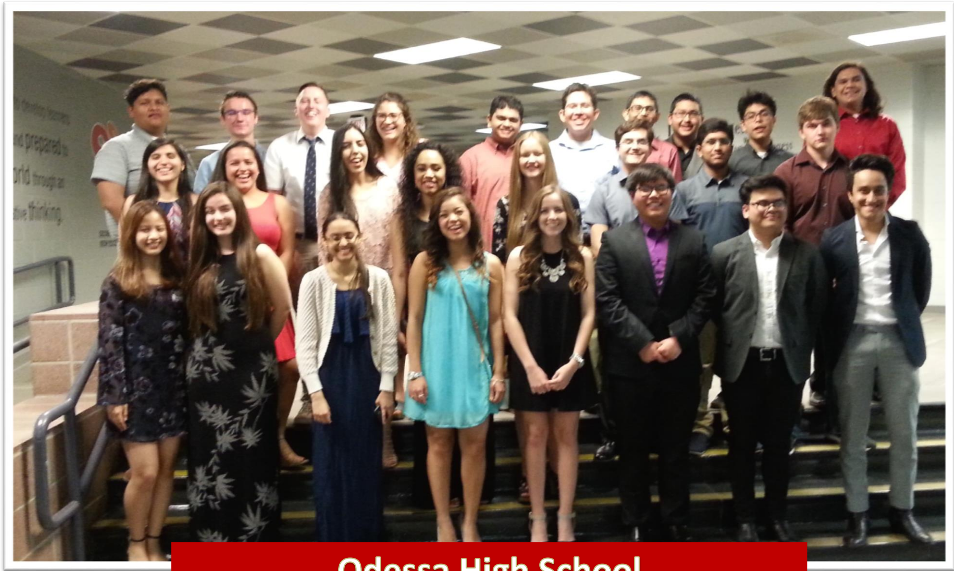
Odessa High School 2017 IB Diploma Candidates