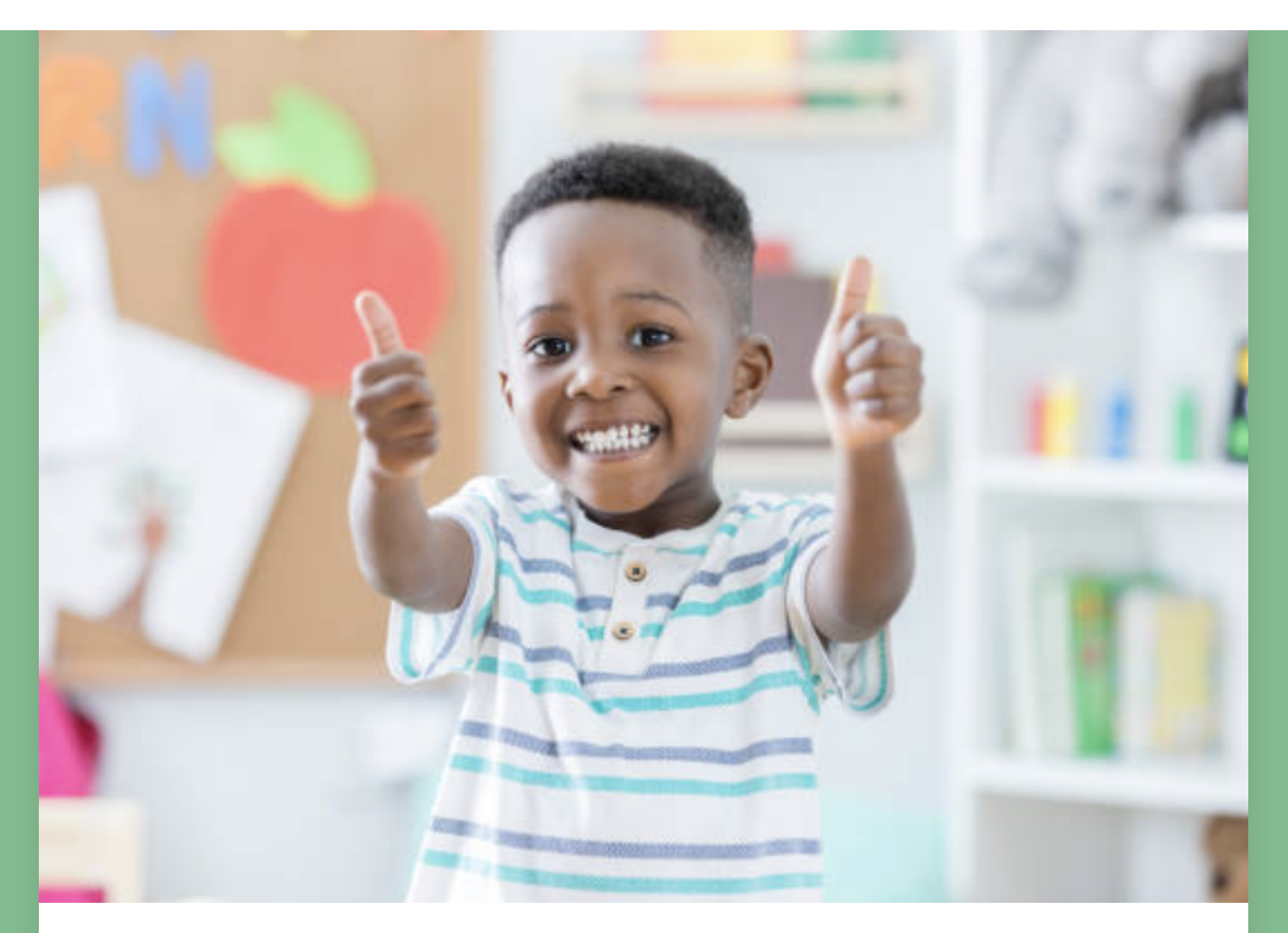
ECERS weekly focus