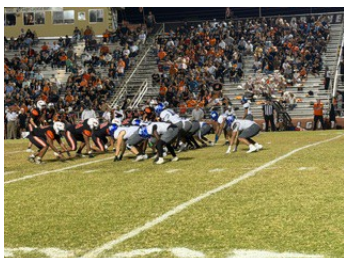
Football in Gonzales