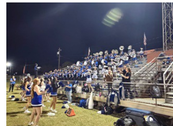
Sprit in the stands in Gonzales