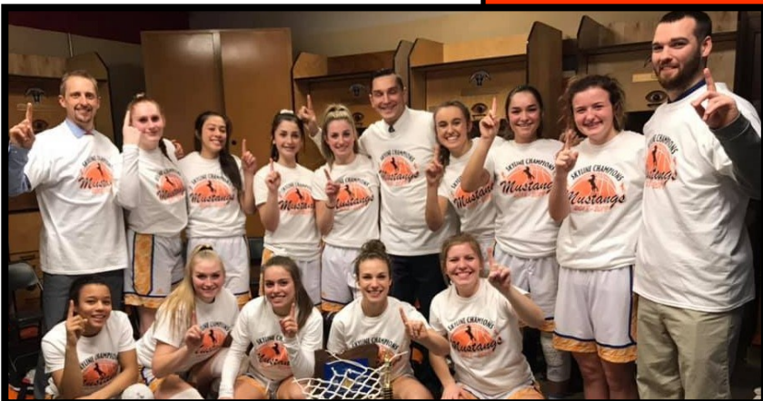
Congratulations to the Girls Basketball Team for making it to the State Playoffs!