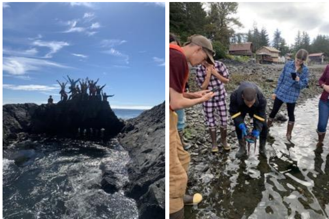
2023-24 ATTSAA Crew!