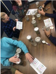
Week 2 - Tongass Tinctures and Botanicals - making medicine from plants