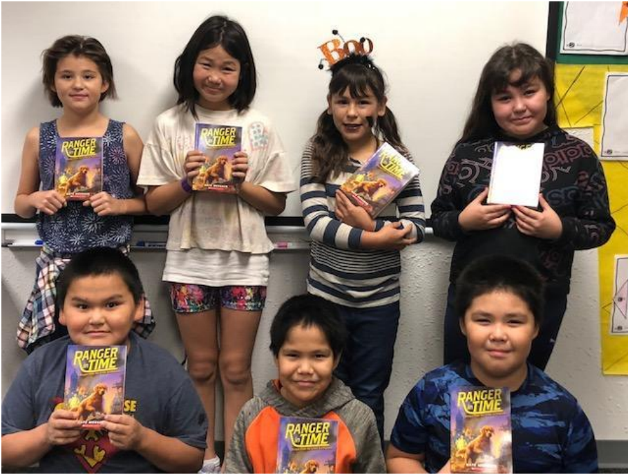
📖 New books!