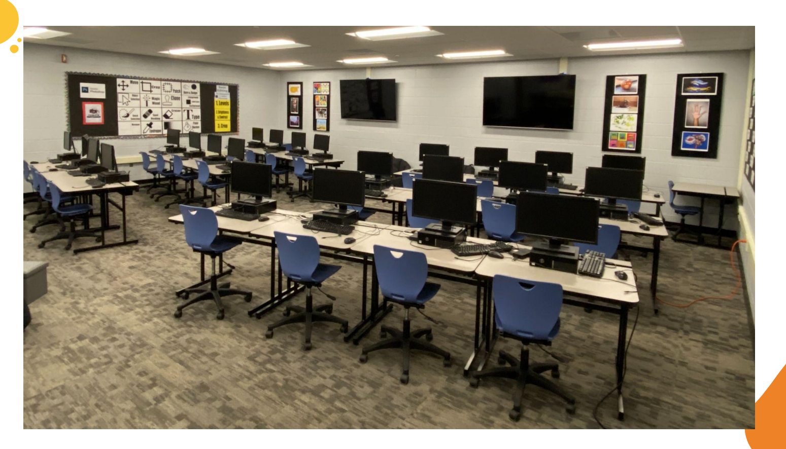
Computer Art Lab