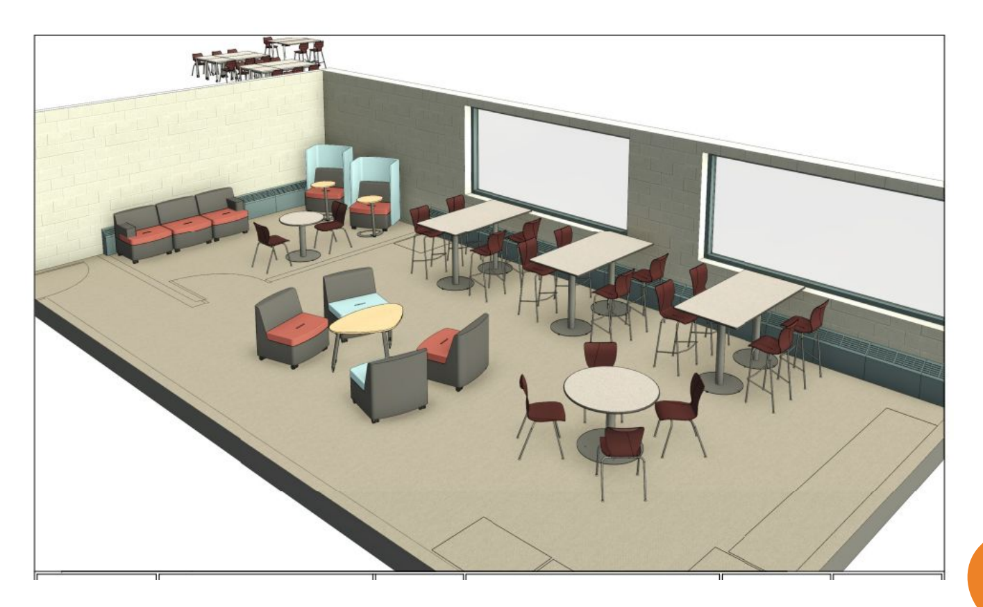
Teacher Lunch Room