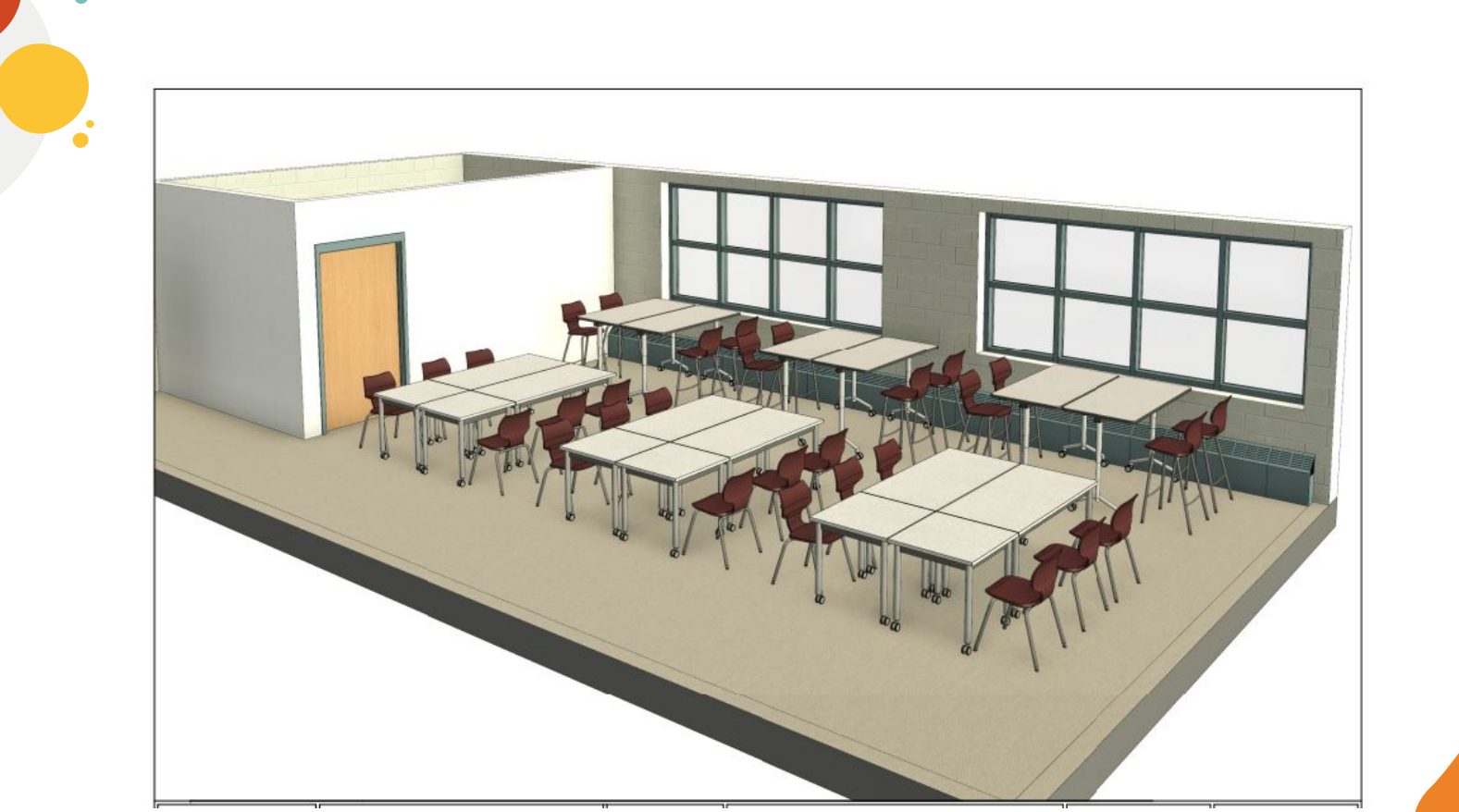
Social Studies Department Commons