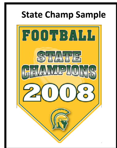
Sample of Gym Display (As shown in Houston HS Gym)