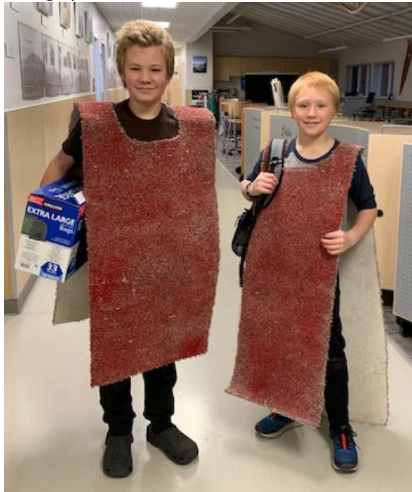
A literal interpretation of "Red Carpet Day".