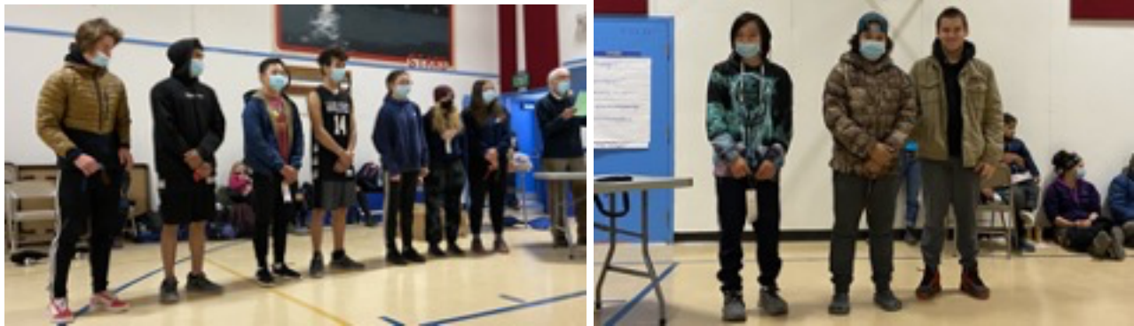
Our varsity Lynx (left) and junior high boys (right) receiving their ribbons at the LPSD Regionals XC meet.