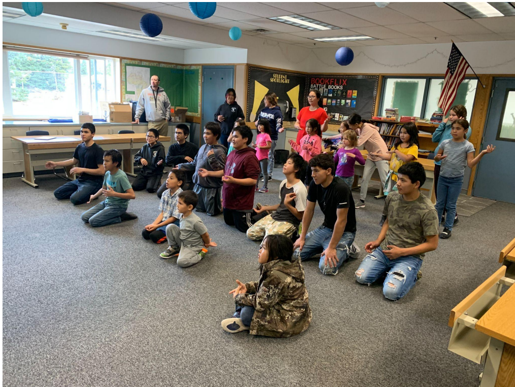
The whole school joined the Igiugig School for a traditional dance class over Zoom. It was a great time, and the plan is to do this every Friday, as schedules permit.