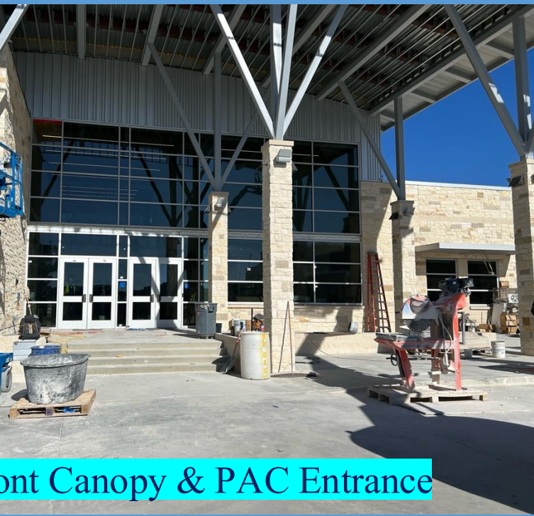
Front Canopy & PAC Entrance