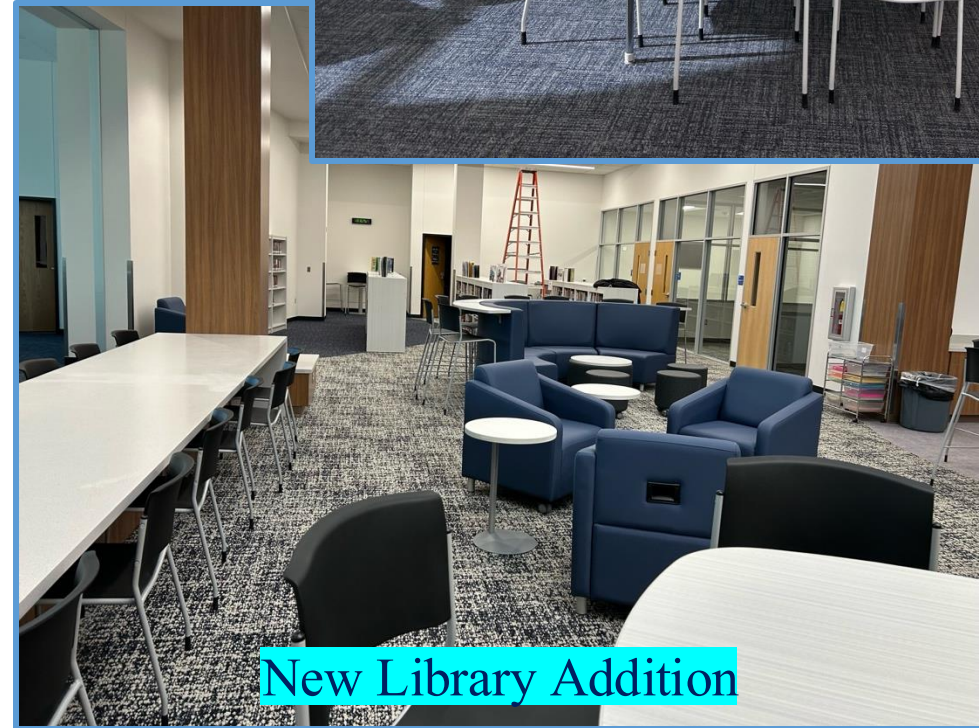
New Library Addition