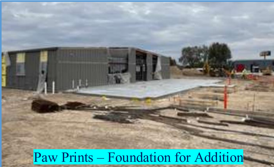
Paw Prints – Foundation for Addition