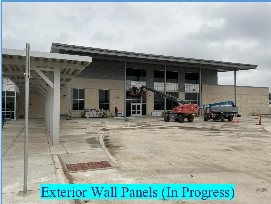
Exterior Wall Panels (In Progress)