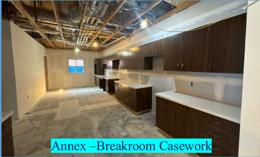
Annex –Breakroom Casework