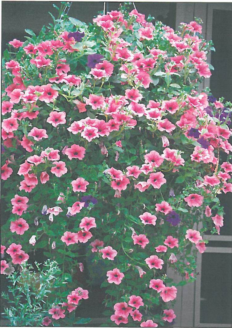
Baskets designed by FFA students.

Located at our Greenhouses and barn facility at HVHS.