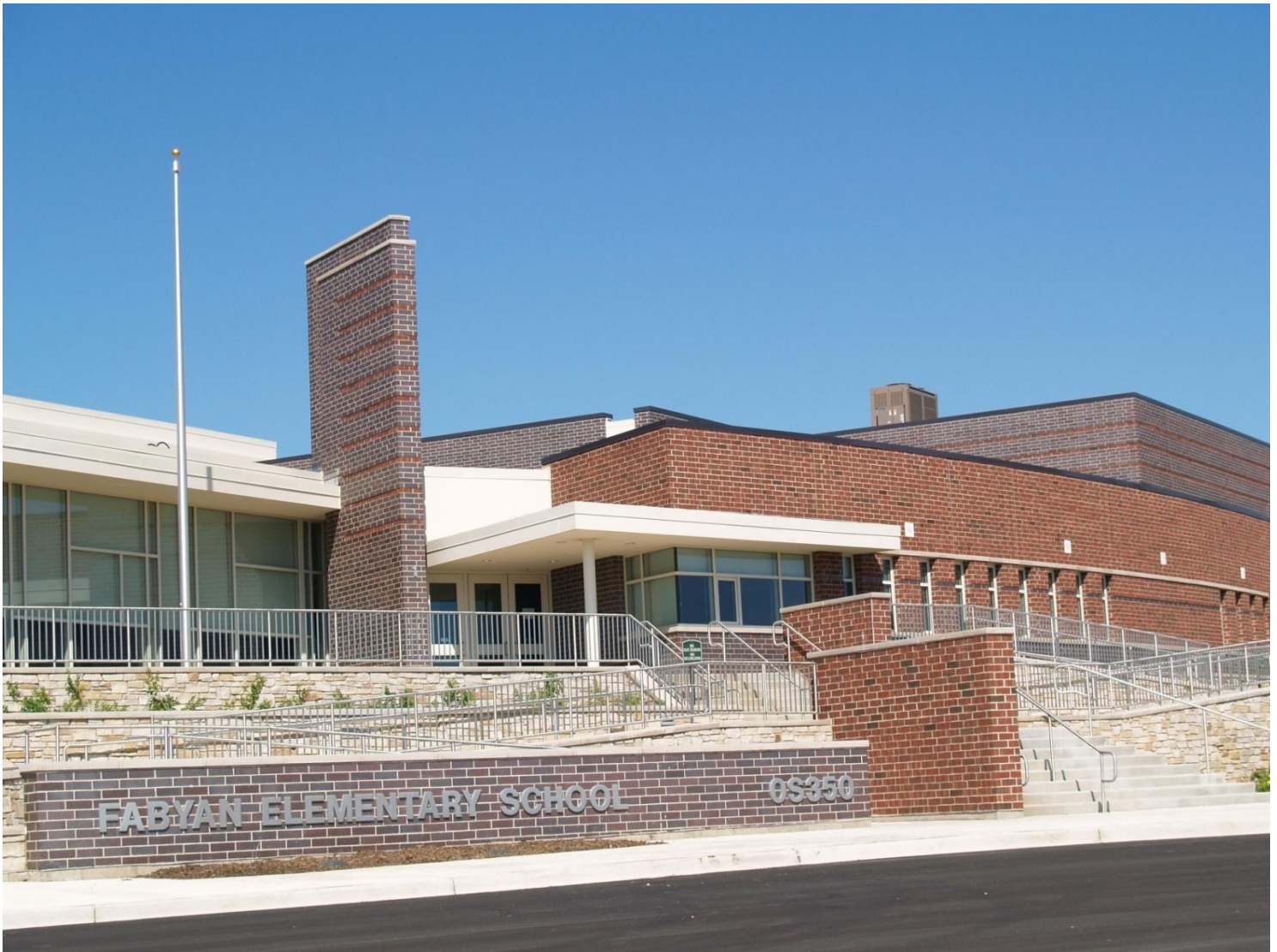
Fabyan Elementary School