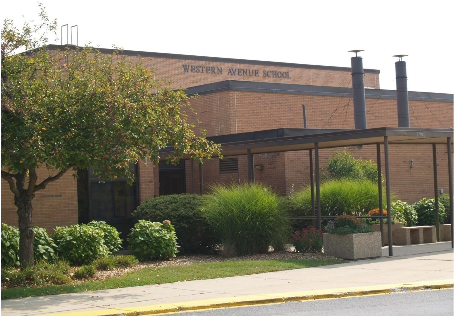
Western Avenue Elementary School