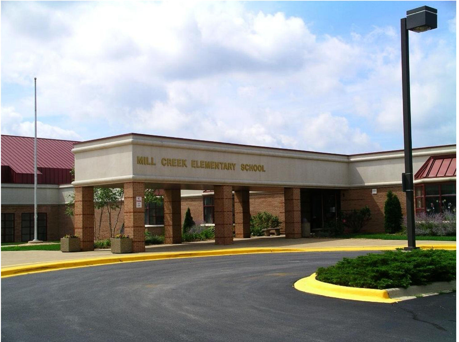
Mill Creek Elementary School