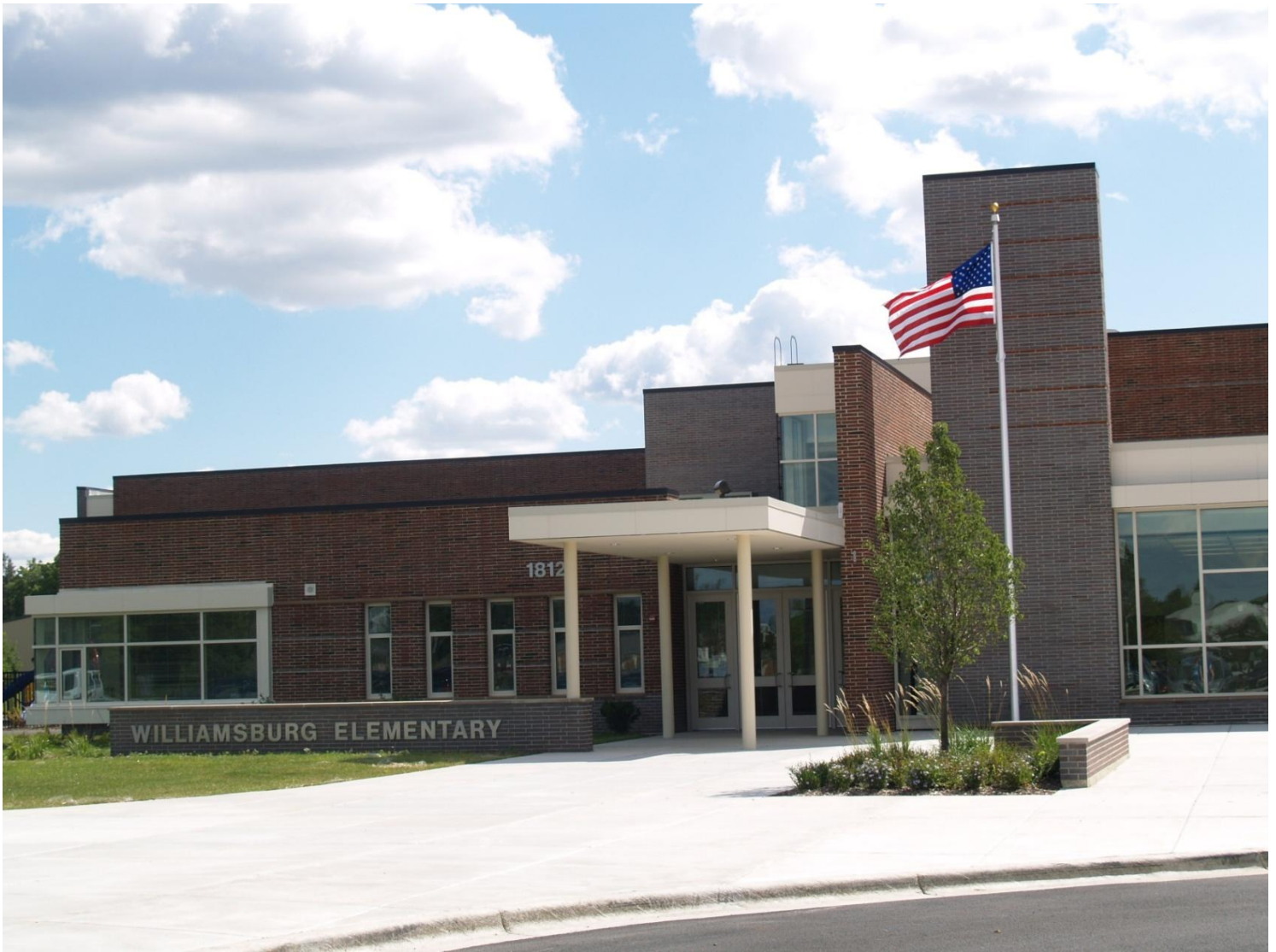
Williamsburg Elementary School