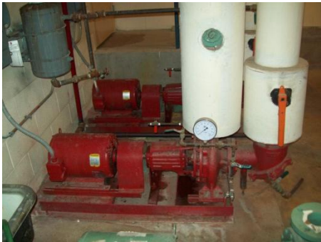
Secondary Boiler Pump

Repair concrete cracks and address heaving. This creates a safety issue.