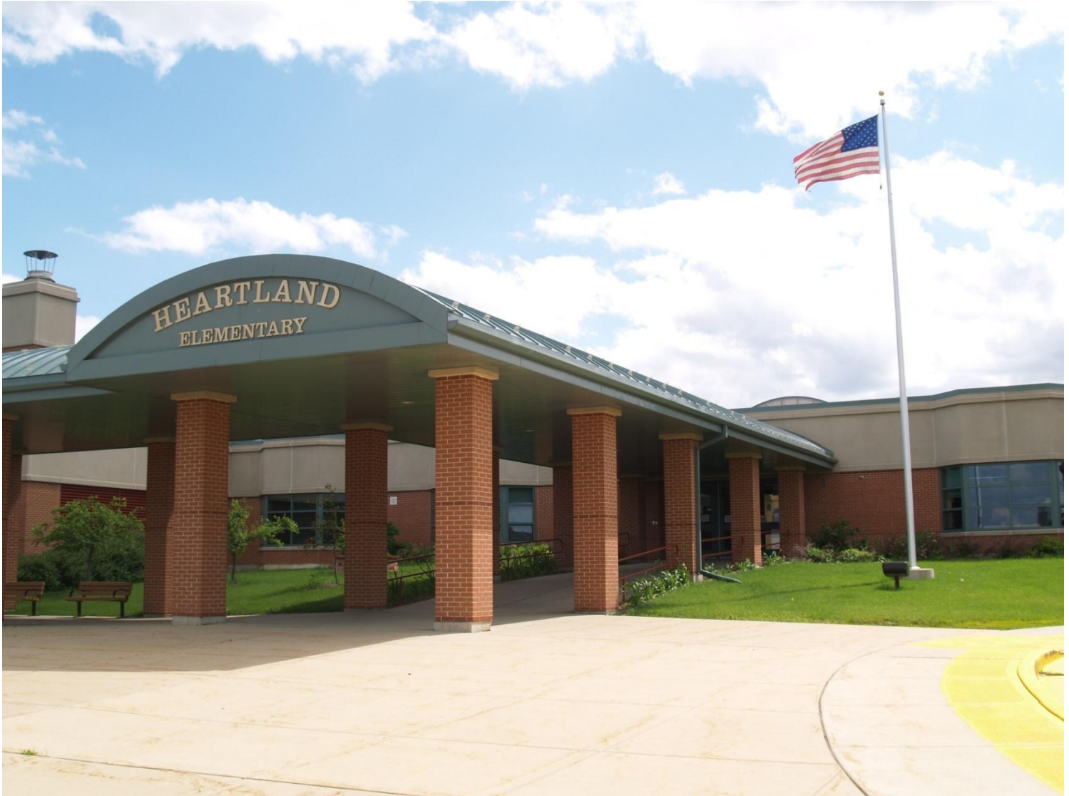
Heartland Elementary School