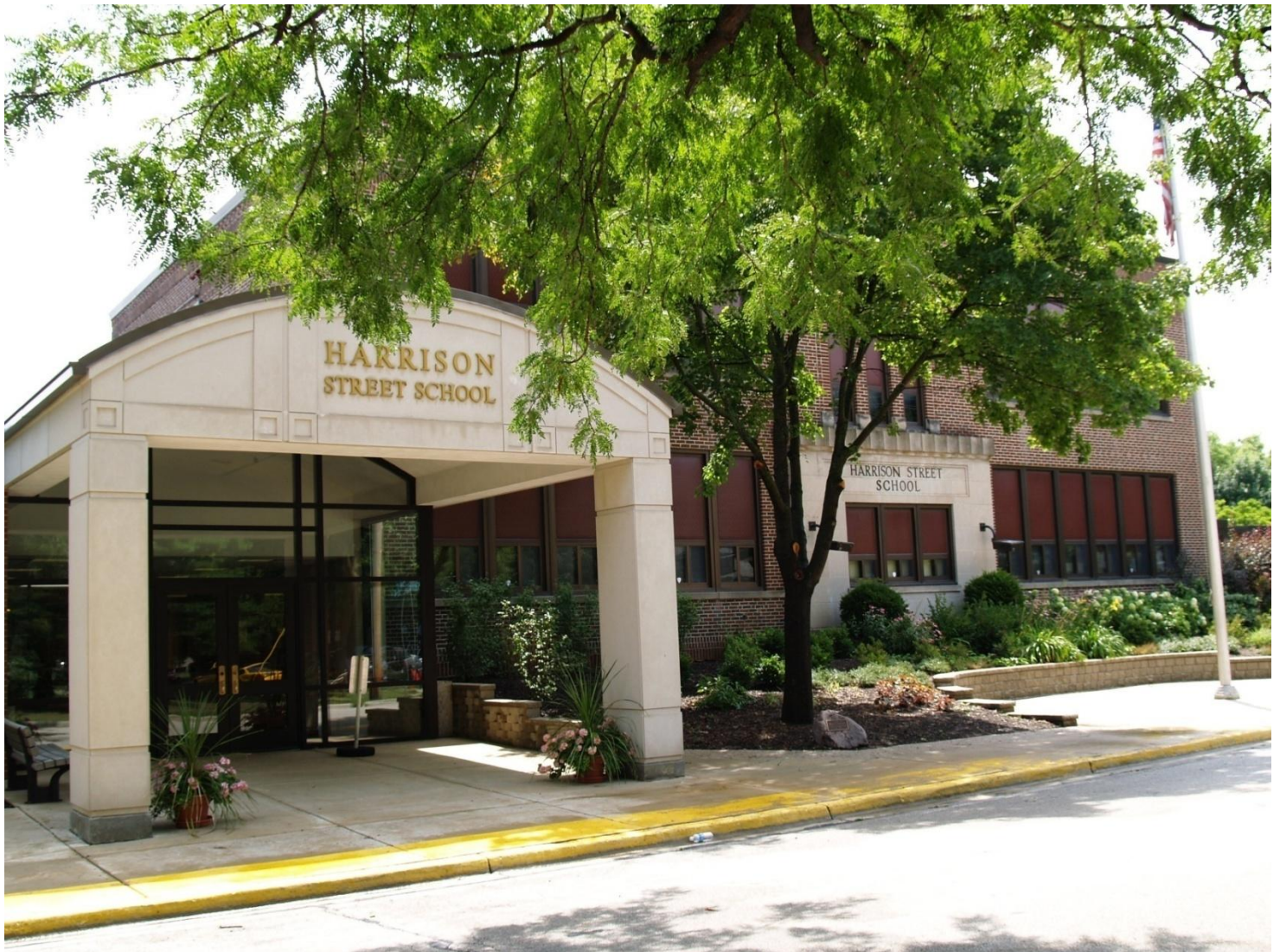
Harrison Street Elementary School