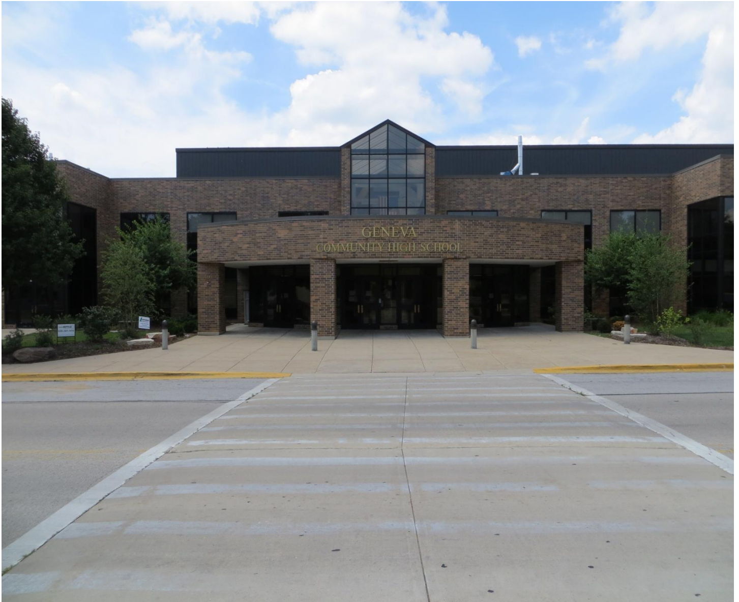
Geneva High School