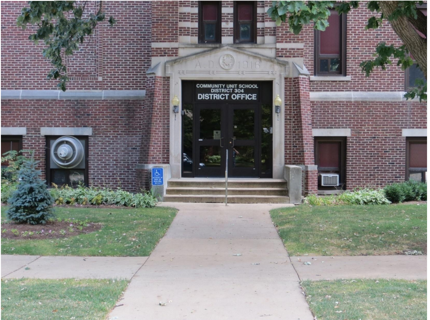
Fourth Street Administration Building