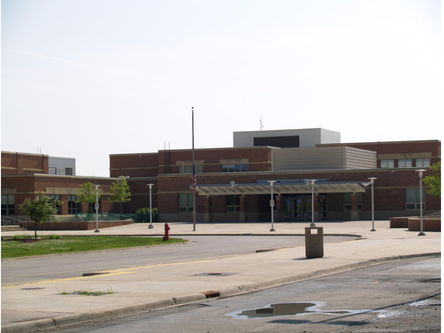
Geneva Middle School South