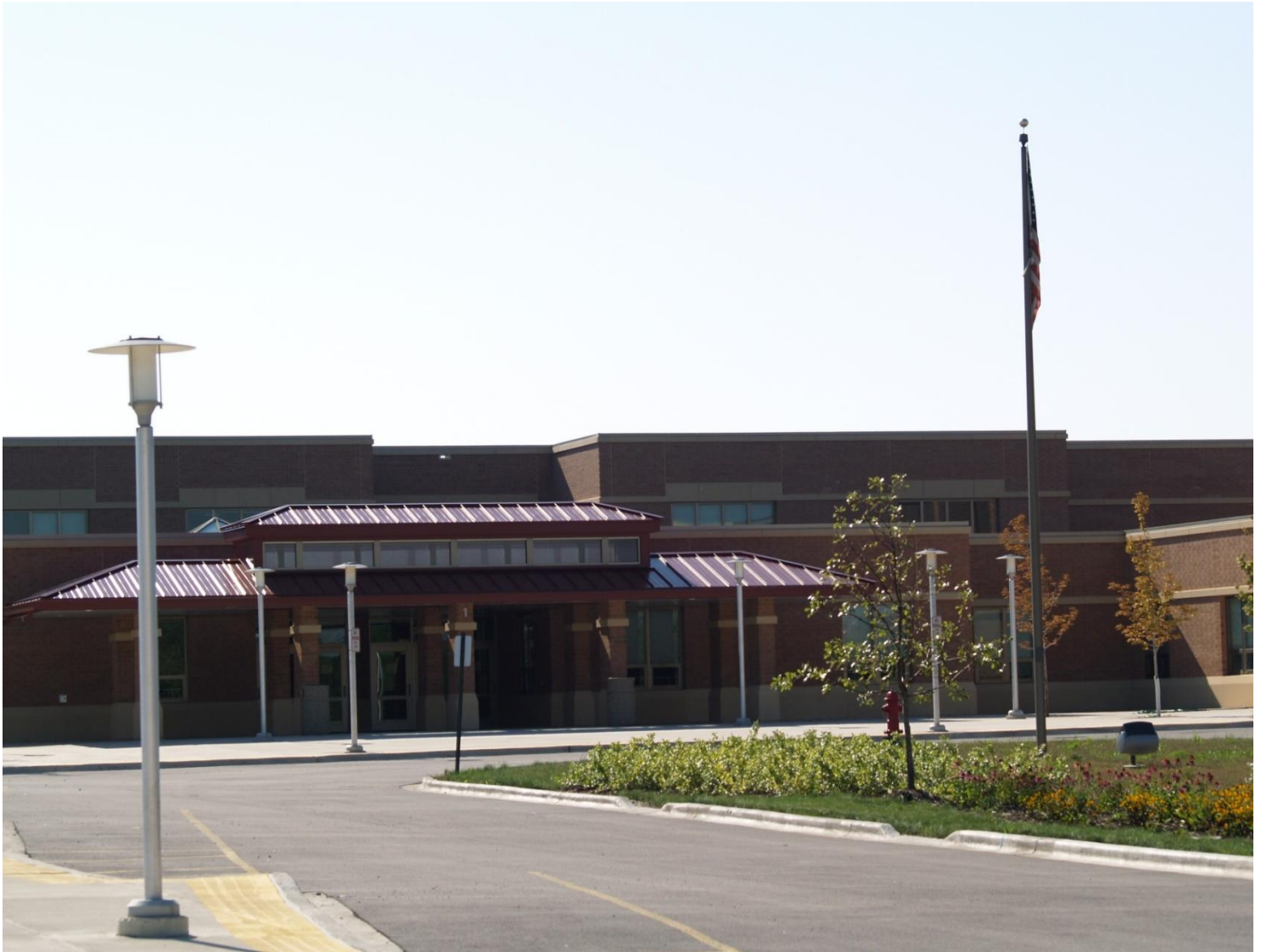
Geneva Middle School North