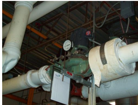
Primary Boiler Pump