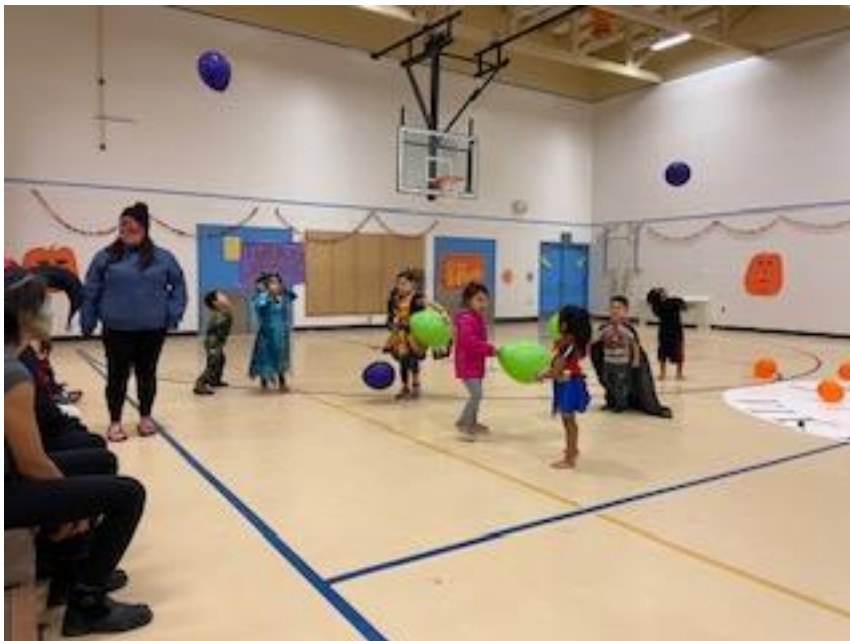
Some of our younger students demonstrate that happiness is a balloon.