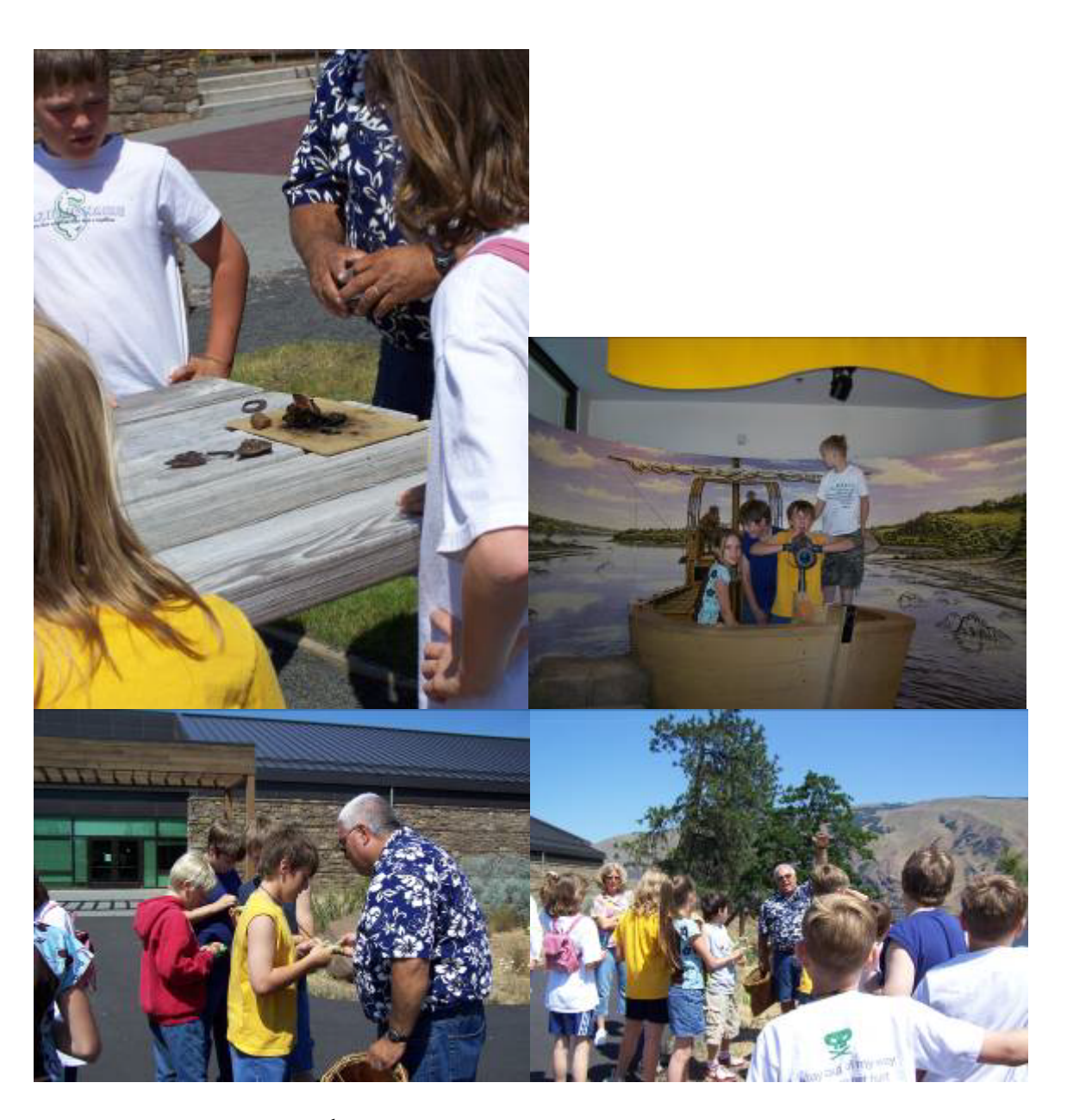
Heppner Elementary 4<sup>th</sup> grade went to the John Day fossil beds. They had the opportunity to dig up fossils older than most of their teachers. The students were very well behaved and enjoyed the experience. It was a hot day and I know the parent chaperones were run ragged. A big thank you to them.