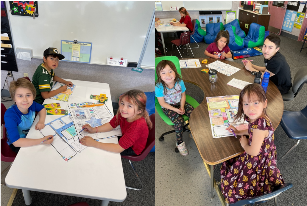
Elementary students are working on an All About Me project to introduce themselves to our teacher candidate.