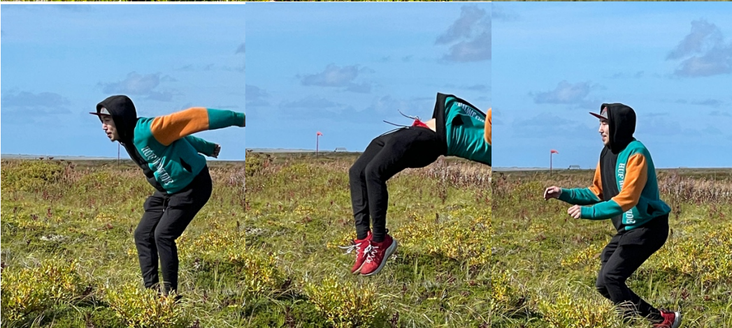
Berry picking and hussock jumping