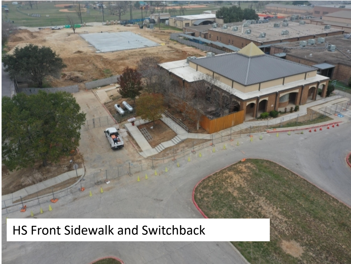
HS Front Sidewalk and Switchback