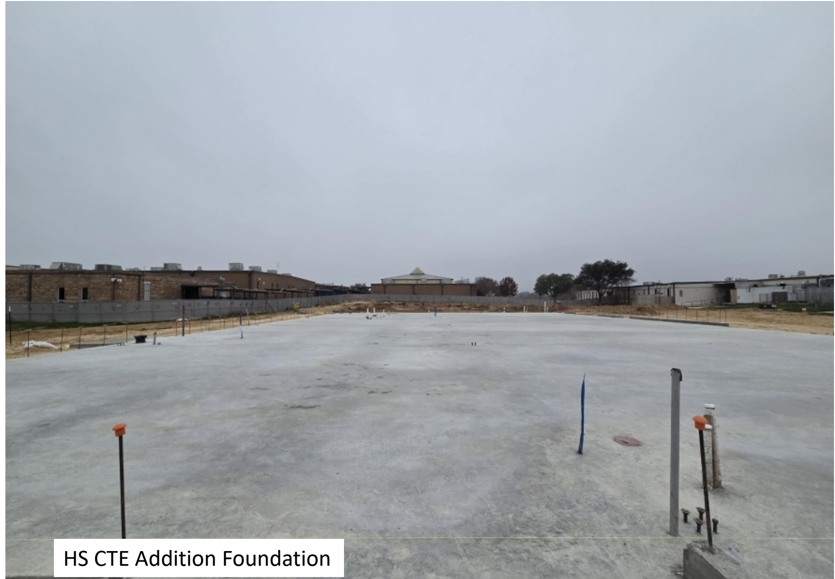
HS CTE Addition Foundation