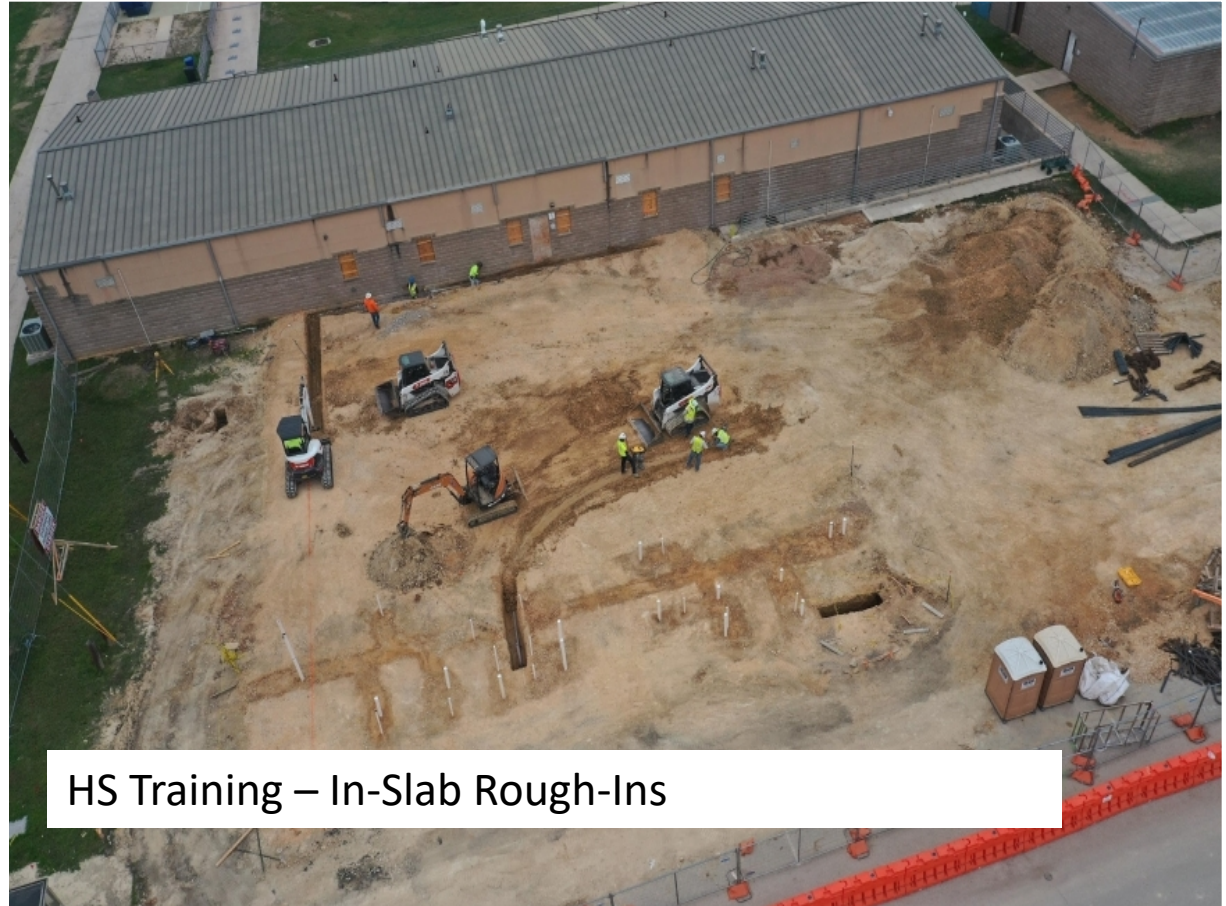
HS Training – In-Slab Rough-Ins