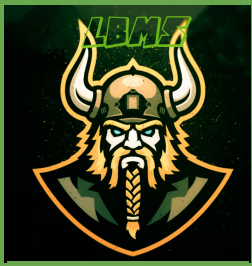
Logo: Denny Choate