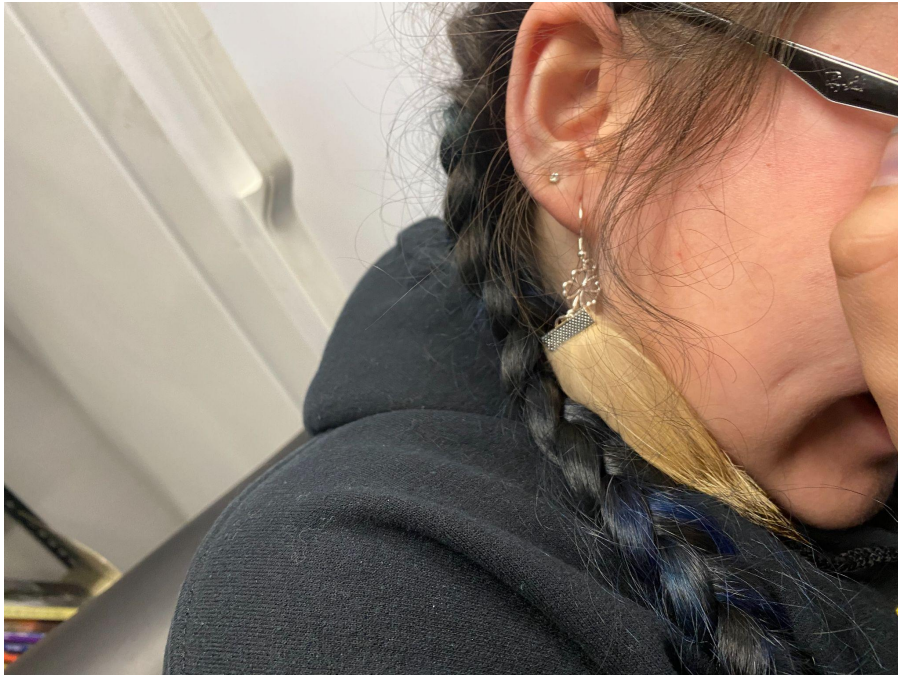
A shy close up of one of those earrings