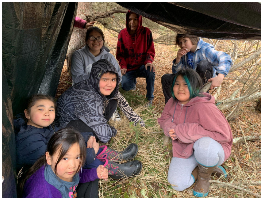
Building a survival shelter