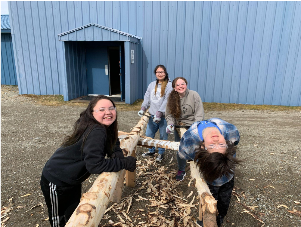
The crew, hard at work ... I guess