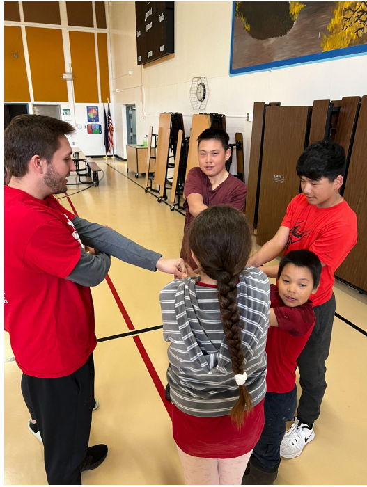
Austin's Red Team