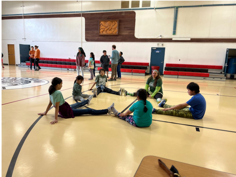
Team bonding and stretch time