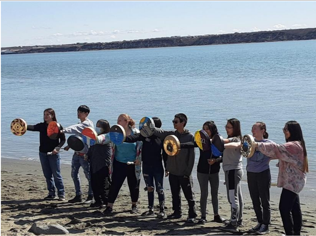
Down on the beach, showing the finished products - nice job!