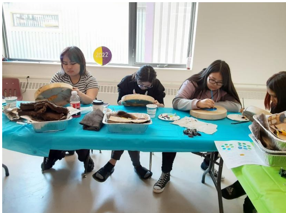
Painting drums ...