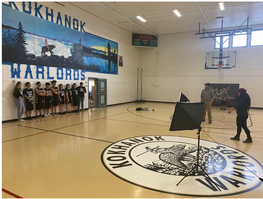
Our school photographer lining up our victorious Warlords. Many thanks to Lysa Lacson