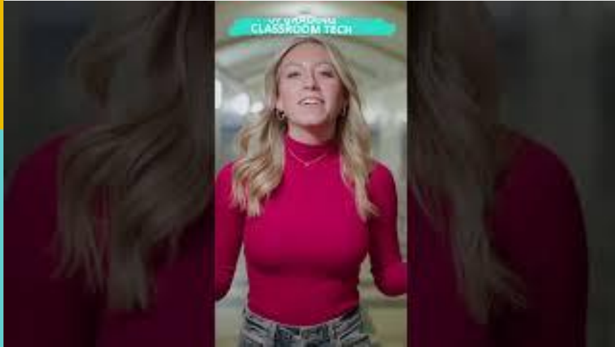
By Story North