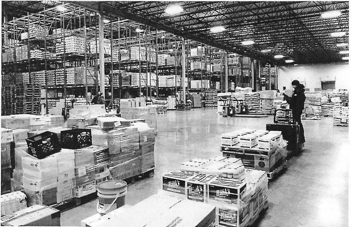
Kohl Wholesale New Distribution Center opened February 2018