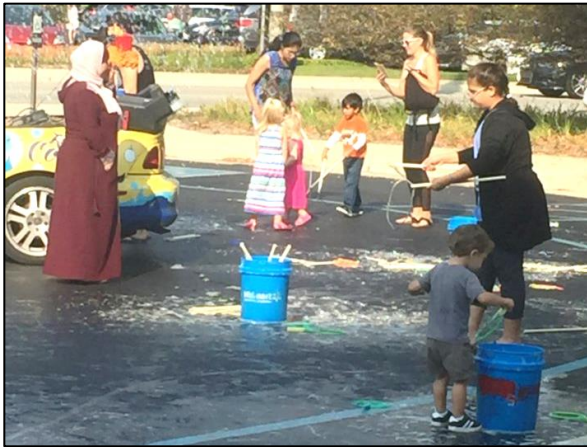
Fun with bubbles in the parking lot.