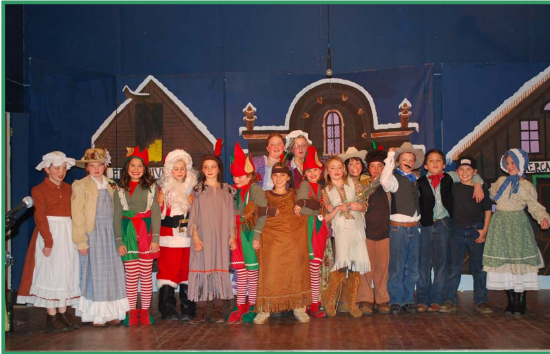
"Finding Christmas 2009"