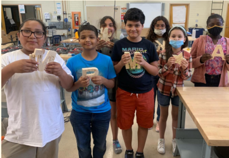
Amphi Middle School students finished up their summer session with some woodworking projects.