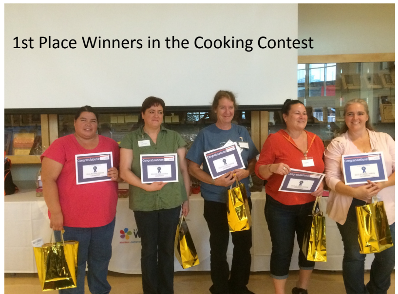
1st Place Winners in the Cooking Contest