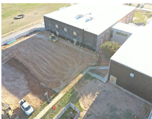
Intermediate School 2-Story Addition