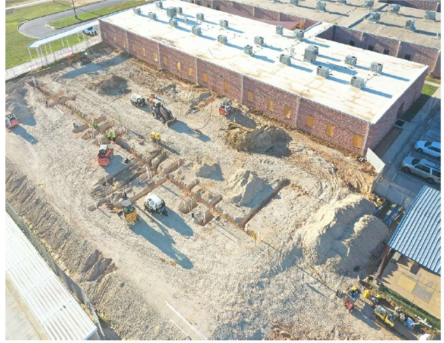
Primary School Classroom Addition