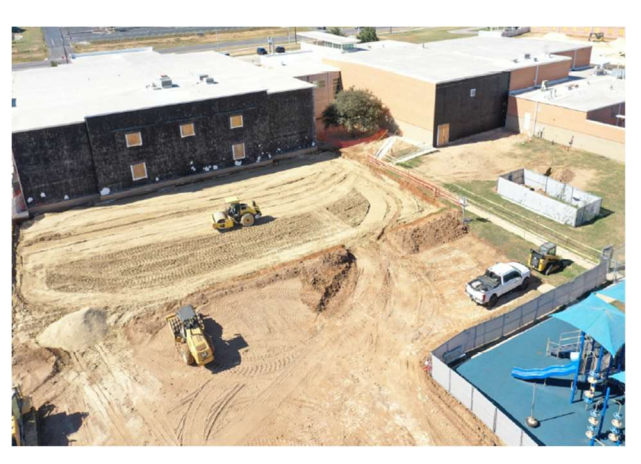
Intermediate School 2-Story Addition (Aerial)