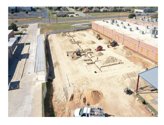
Primary School Classroom Addition (Aerial)