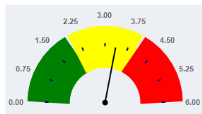
Incidents - Total Case Incident Rate