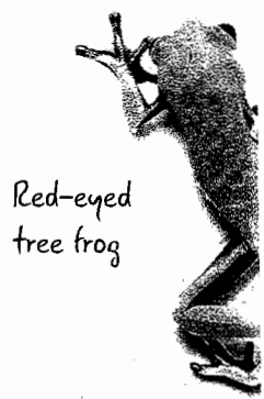
Red-eyed tree frog

Your Tour Director takes you to Liberia, the capital of Guanacaste province, for your flight home.