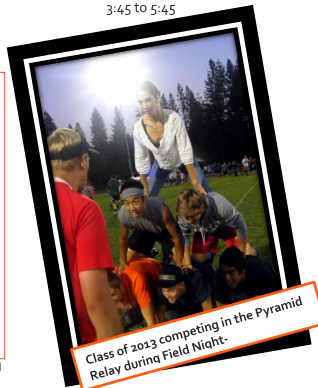
Class of 2013 competing in the Pyramid Relay during Field Night-