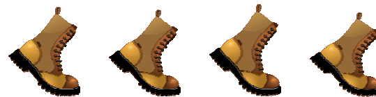
TABLE ROCK FIELD TRIP

Thursday, May 13 th , is Kindergarten Round-up registration for student that will be attending Jerome Prairie for the 2010/2011 school year. The child will need to be 5 years old before September 1 st in order to attend Kindergarten in the fall. We will need parents/guardians to bring a copy of their child's immunization records and birth certificate on the evening of registration. (If you have the originals, we can make a copy here at school.) This is a great time for your child to meet his/her teacher, see their classroom room for the coming year and become familiar with the school. We urge all parents and future Kindergartens to attend. If you know of anyone who has a child/children who will be 5 by September 1 st and live in the Jerome Prairie area, please let them know of this event.