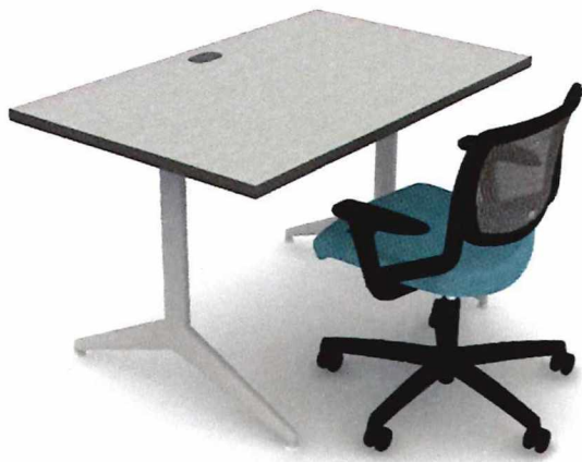
SEATING HEIGHT TABLE MOTIVATE CHAIR