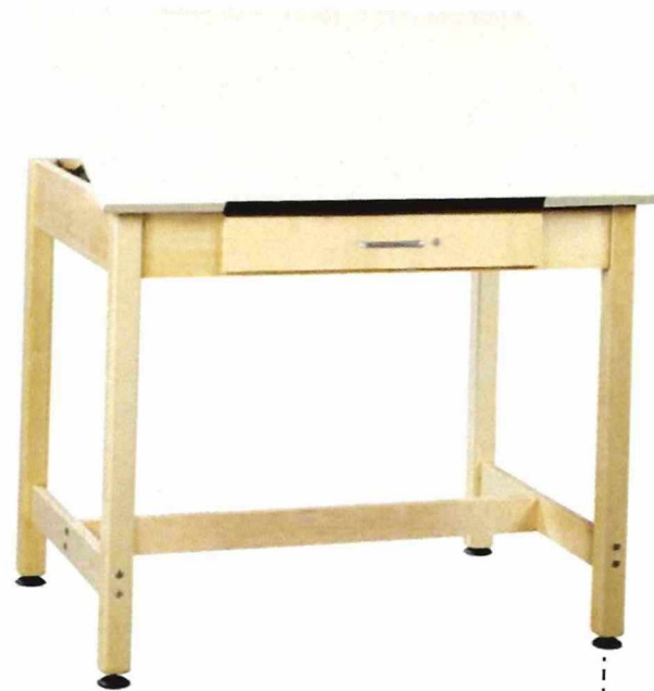
ADJUSTABLE TOP *LARGE DRAWER SHOWN BUT SMALL DRAWER IS SPECIFIED