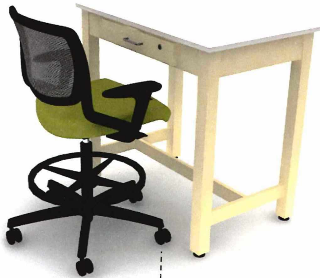
DRAFTING TABLE CAFÉ HEIGHT MOTIVATE CAFÉ HEIGHT STOOL