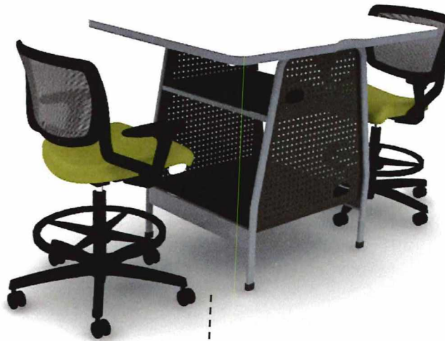
MAKERSPACE TABLE WITH SHELVES MOTIVATE CAFÉ HEIGHT STOOL