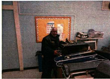
Instruments for King

modest donations. I am always amazed at what these donations mean to the schools in need of supplies, the children in need of uniforms or the families trying to make ends meet. This experience has enriched my life, just as it has enriched the lives of so many families in need."