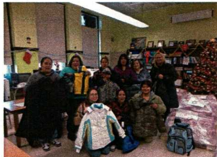
Coats being put to use